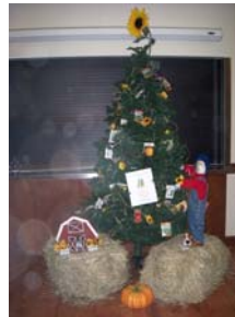
2 nd Place Tree Seals Den The Sunflower Parable by Liz Curtis Higgs